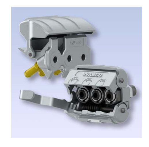
New WABCO TrioMatic couplings